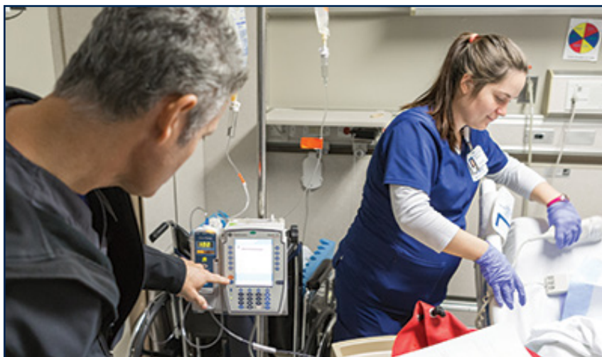
Andexanet Alfa in the Management of Life-Threatening Bleeds in Patients on Direct Factor Xa-Inhibitors | Supported by Alexion

To support practitioners in the planning and execution of an MUE, the Foundation created two MUE resource guides, each with an accompanying webinar, that provide a framework for conducting an MUE and can be adapted to apply to other medications and clinical scenarios.