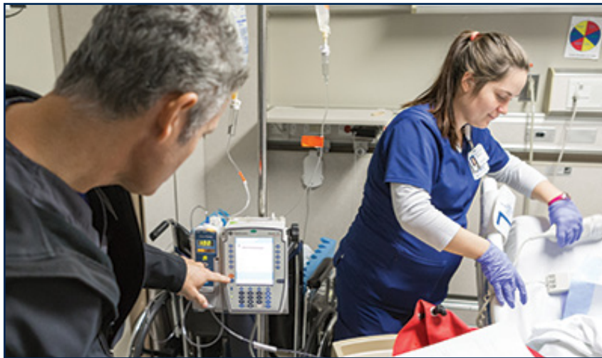
Andexanet Alfa in the Management of Life-Threatening Bleeds in Patients on Direct Factor Xa-Inhibitors | Supported by Alexion

To support practitioners in the planning and execution of an MUE, the Foundation created two MUE resource guides, each with an accompanying webinar, that provide a framework for conducting an MUE and can be adapted to apply to other medications and clinical scenarios.