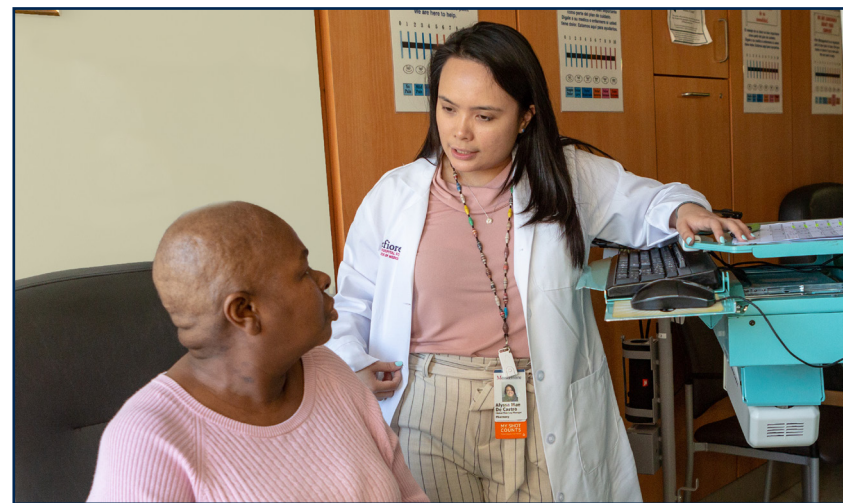
Treatment of Skin and Soft Tissue Infections in the Emergency Department: Evaluating Omadacycline Use | Supported by Paratek