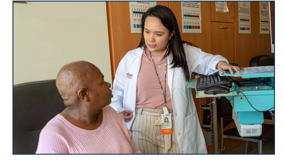
Treatment of Skin and Soft Tissue Infections in the Emergency Department: Evaluating Omadacycline Use | Supported by Paratek

Andexanet Alfa in the Management of Life-Threatening Bleeds in Patients on Direct Factor Xa-Inhibitors | Supported by Alexion