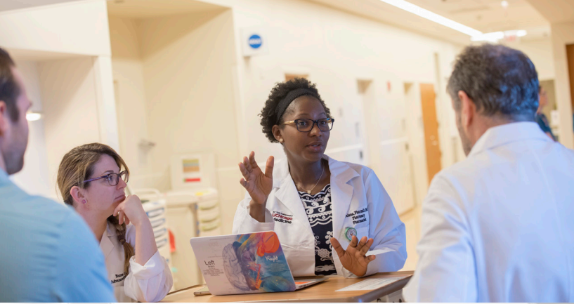
FIGURE 4. PHARMACIST ROLES