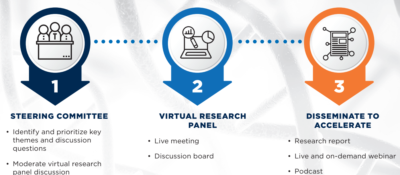
FIGURE 2. PROJECT APPROACH

The project included three steps 1) Engagement of an expert steering committee, 2) Convening of a virtual research panel (VRP), and 3) Dissemination of findings and recommendations (see Figure 2). A ten-member steering committee was composed of experts representing diverse stakeholders, including health-system and specialty pharmacists, physicians, and payers (see Table 1). During its preliminary work, the steering committee identified key domains important for and believed to be impacting the adoption of biosimilars (see Figure 1). For each domain, the committee identified a series of questions to guide the VRP discussion (See Appendix 1). Sixteen participants were