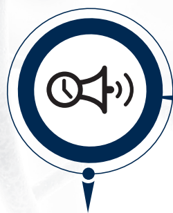
FIGURE 5. ACCELERATING ADOPTION

P atient and provider education is critical to the adoption of biosimilars. Providers must feel confident that the therapy will be safe and effective for their patients and, as the patient's advocate, ensure the patient can access indicated therapies at the lowest out-of-pocket cost. Unfortunately, the provider has no incentive to switch therapy for stable patients, resulting in an administrative burden (costs, time, and resources) with no return. It is particularly challenging for smaller practices with limited resources to create educational materials, navigate copay assistance programs, and process prior authorizations. Furthermore, there is often little incentive (e.g., reduction in their copay or premiums) for patients to switch therapy, but some perceived risk, if they are stable and tolerating their therapy well. In some cases, biosimilars can even be more costly to the patient because copay cards are