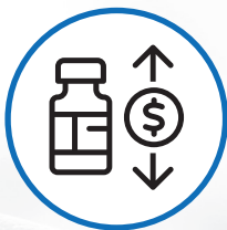
FIGURE 3. EXAMPLES OF BIOSIMILARS METRICS