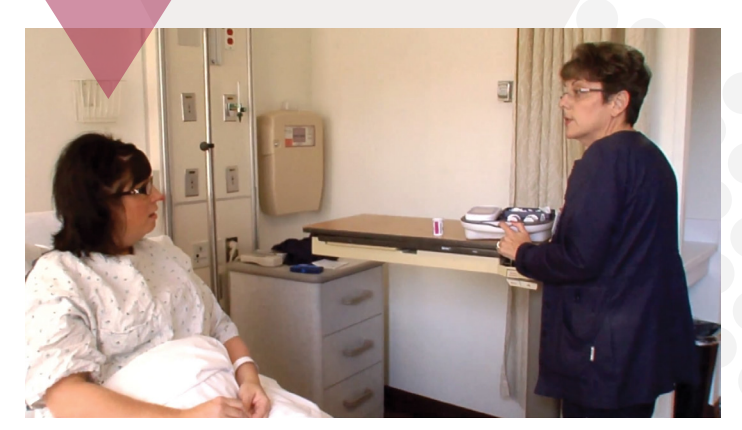
Severe hypoglycemia was a major concern to all of BJCHealth's medical staff.

The BIC Scorecard showed consistent decreases, and as ADE rates dropped, BJC HealthCare staff grew more excited and enthusiastic about the project. "Everyone knew about the initiative and had bought into it because we were evidence